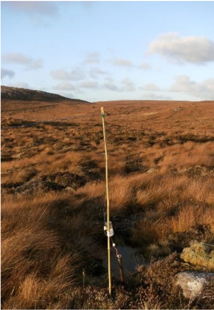
Above: earth rod at end of 620m Far East beverage.