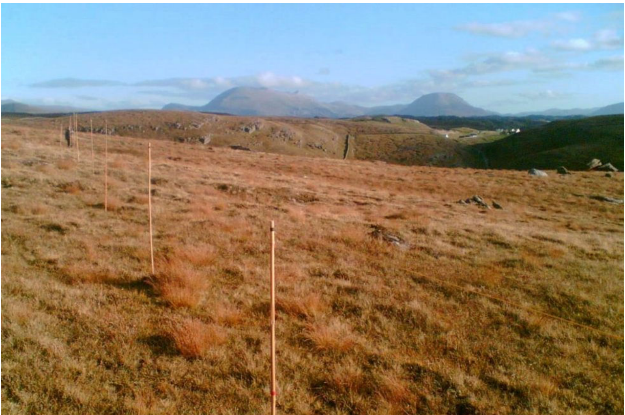
Above: Looking south from the North American beverage – Arkle & Foinhaven on the skyline.

Although conditions were initially quite poor, reception gradually improved and by the end of the first week we were starting to hear weak Trans Atlantic DX after about 2200 and plenty of signals from Asia and the Far East peaking around 1600-1800 UTC. Reception continued to improve into the second week with excellent Asia/Far East reception. We were especially pleased to hear Radio Nepal for the first time, on three frequencies. North American DX was hampered by noise on the aerials although we heard plenty of stations mostly from the east coast. The weaker signals from more western North American stations proved elusive except on the last day when there was a later fade-out (around 10.15 am local time, over an hour late than previous days) with a few Mid-West stations being logged. We had hoped to hear Latin American stations on the tropical bands but conditions were not favourable to that part of the world though we were pleased to be able to log a good number of Central and Latin American stations on medium wave off the back of the Middle East aerial. Not much was logged from Africa but a definite highlight was GRTS Gambia on 648 kHz thanks to the frequency now having been vacated by BBC World Service. Curiously it was also heard best on the Middle East aerial, which helped null out Spain.