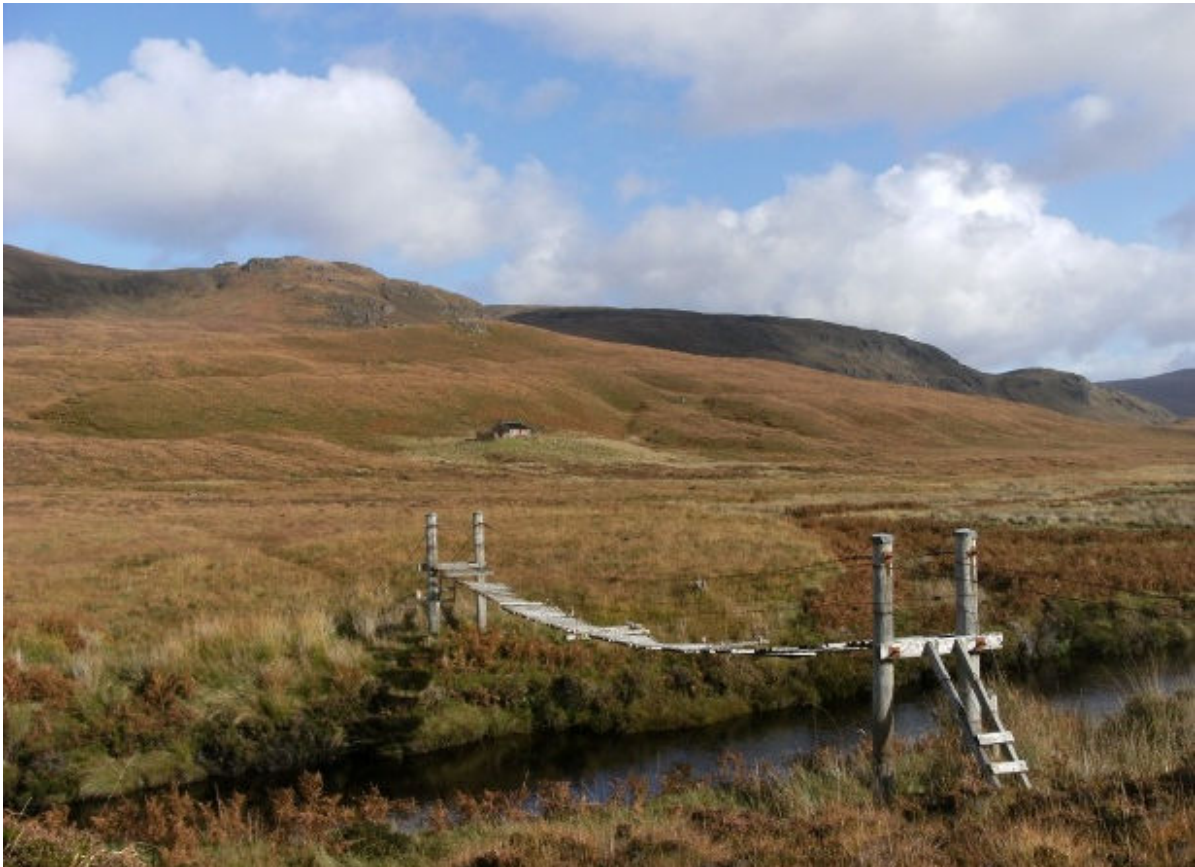
Above: rickety bridge on walk to Strathan bothy (in distance) – east of Sheigra.