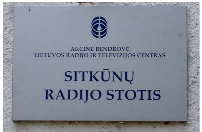
Above: Sign on the Sitkunai gatepost. Left: Yours Truly and the Continental SW transmitter.

The other mediumwave transmitter is a 150 kW Russian Shtorm (installed in 1964) on 1557 kHz (for relays). In addition, there is also one active 100 kW Continental shortwave transmitter that came into service on 1 st April 1999. Of course when we visited in September we did not know that Radio Vilnius, who lease time on this transmitter from LRTC, were planning to