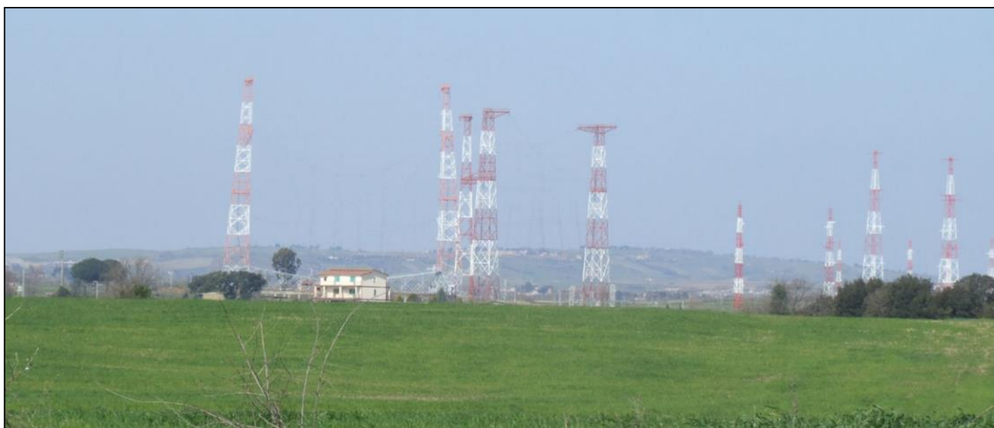
Santa Maria di Galeria