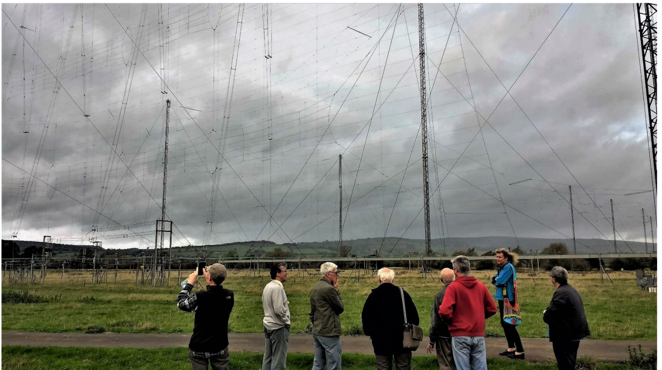
Above: our group admire part of the extensive aerial arrays at Woofferton, straddling two counties!

Looking away from the building, it was difficult to assess how many transmitter masts with arrays hung between them there were. An on the spot estimate was 22 or 23 masts? Each array can cover one, two or four shortwave bands. Although pointing in a fixed direction, each aerial array can be electronically turned a few degrees (or slewed) to target a particular country. And certain arrays can also be reversed to target the opposite direction if necessary. Maintaining or repairing the arrays is a specialist job with high winds or ice building up on the wires a hazard. Underneath, the grass is kept cropped by sheep.