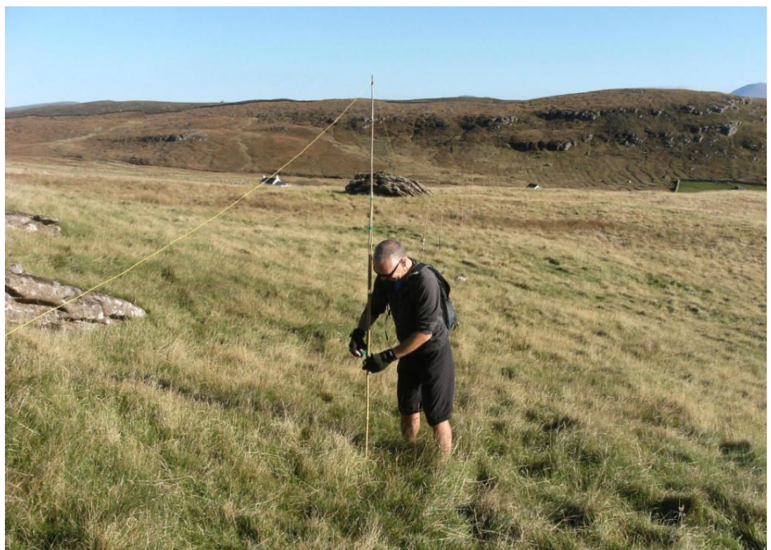
Right: Dave fixing a join on one of the tall canes supporting the middle section of our North American beverage in Week 2. To gain extra height in this area, which is prone to damage by deer, two 5ft canes are taped together.

Unfortunately electrical interference can be a problem at Sheigra nowadays, its not as strong as we are used to at home, but can be particularly troublesome in the mornings when North American DX signals fades into electrical noise (about S3 to S5 on the meter) rather than into the receiver noise floor. But in the afternoon and overnight period the DX signals are usually strong enough not to be troubled by it. The QRM seems to be coming in via the electricity supply and phone lines.