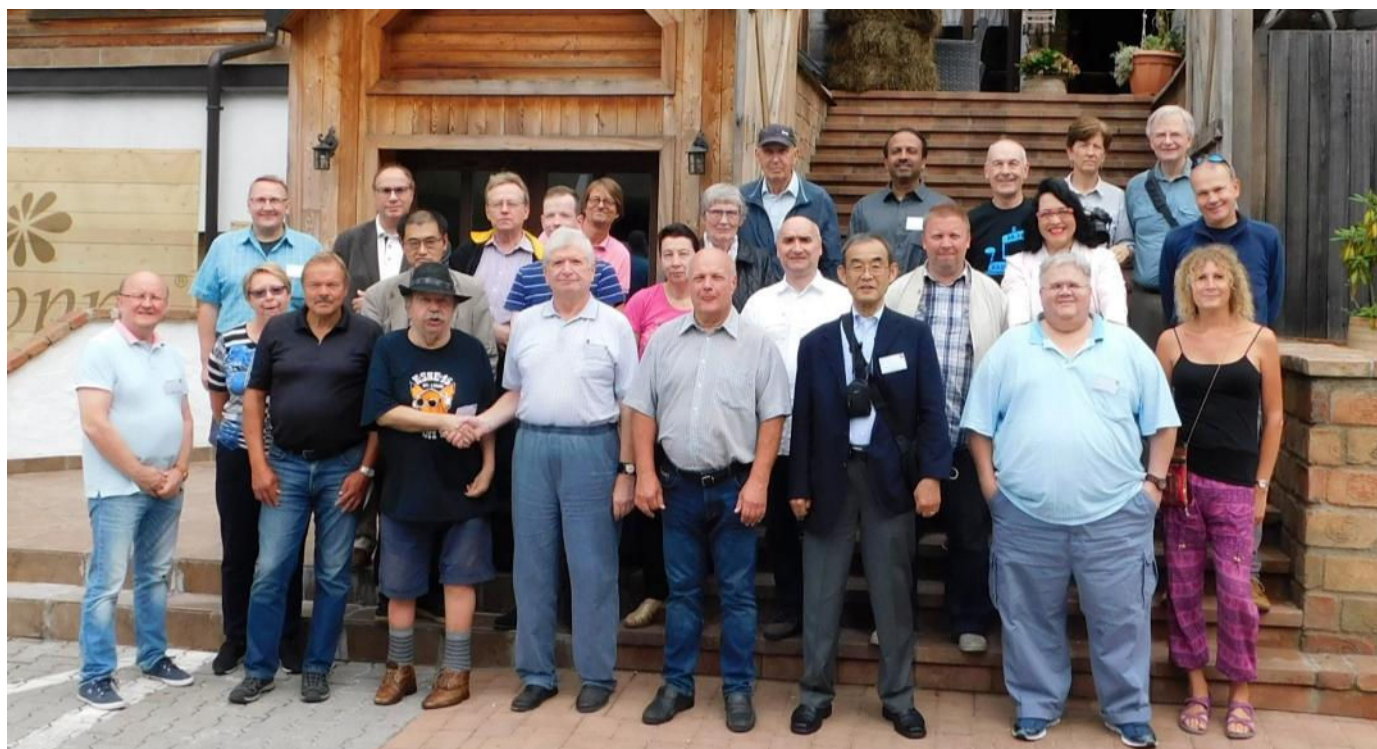
Above: (most of) the EDXC delegates at Hotel West, Bratislava

Checking out of Hotel West, we then travelled west by coach to Vienna (see Part 2! ).