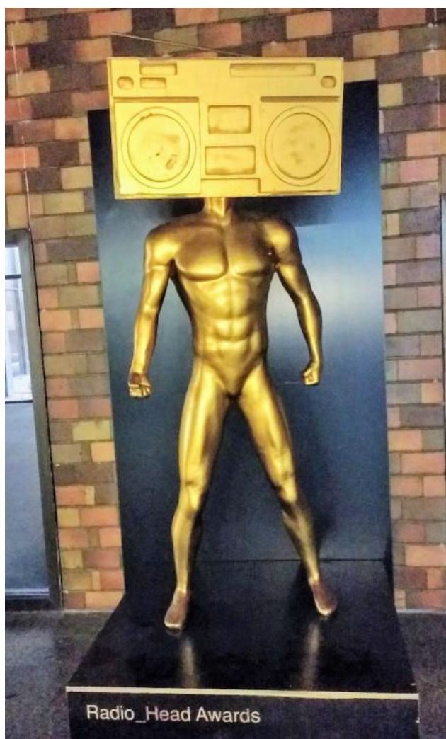
“Radio Heads” statue (Slovak Radio HQ)