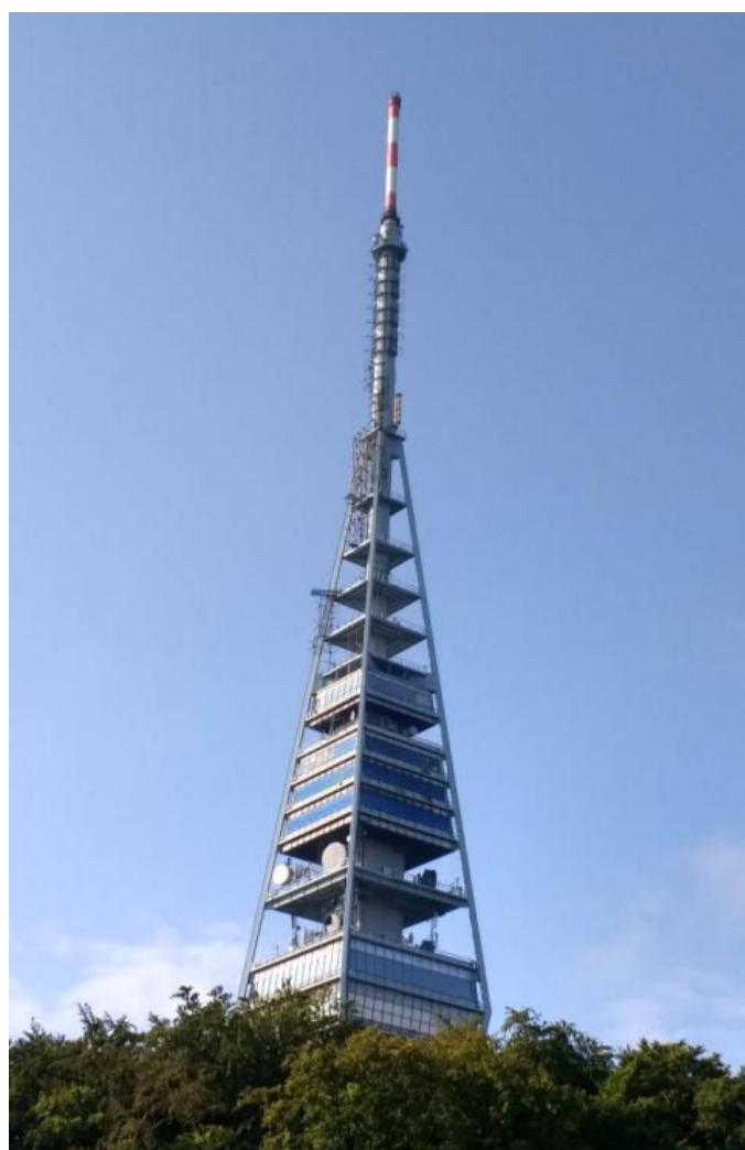
Kamzik radio & TV tower