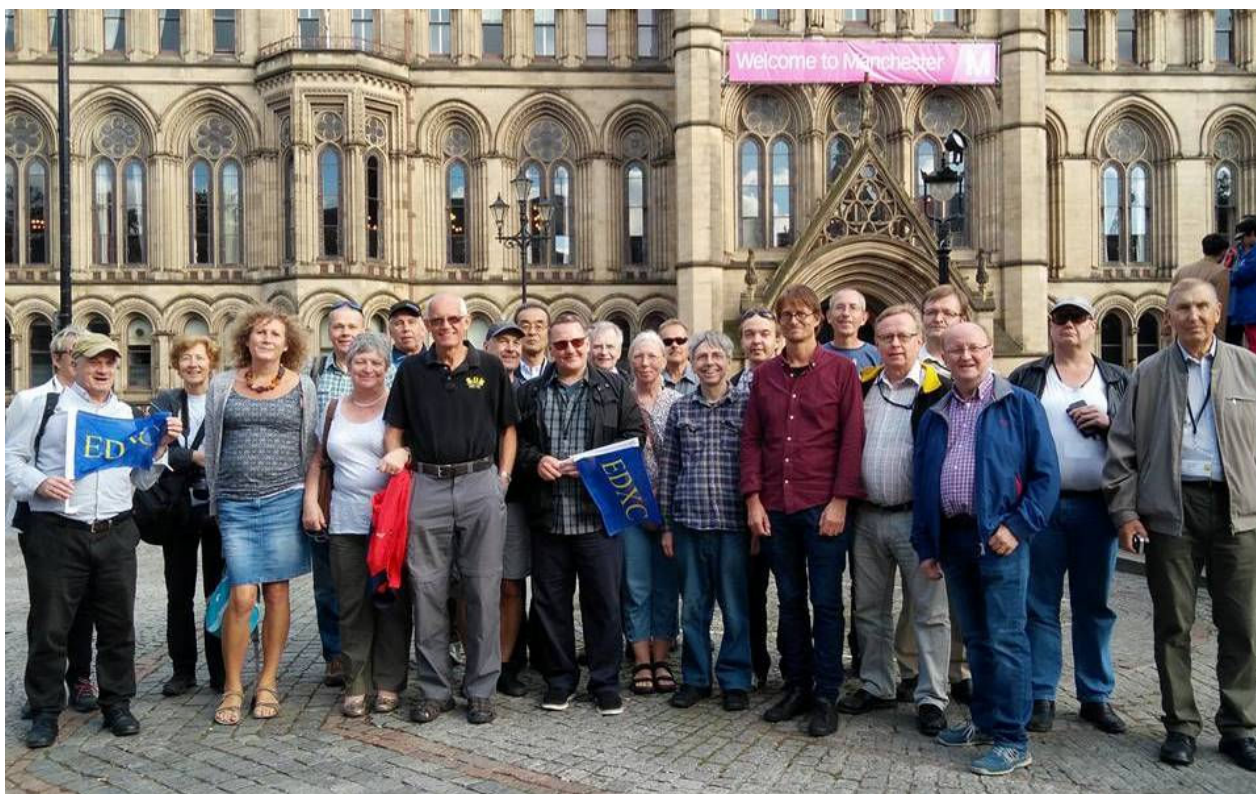
Above: in Albert Square, Manchester Town Hall behind.