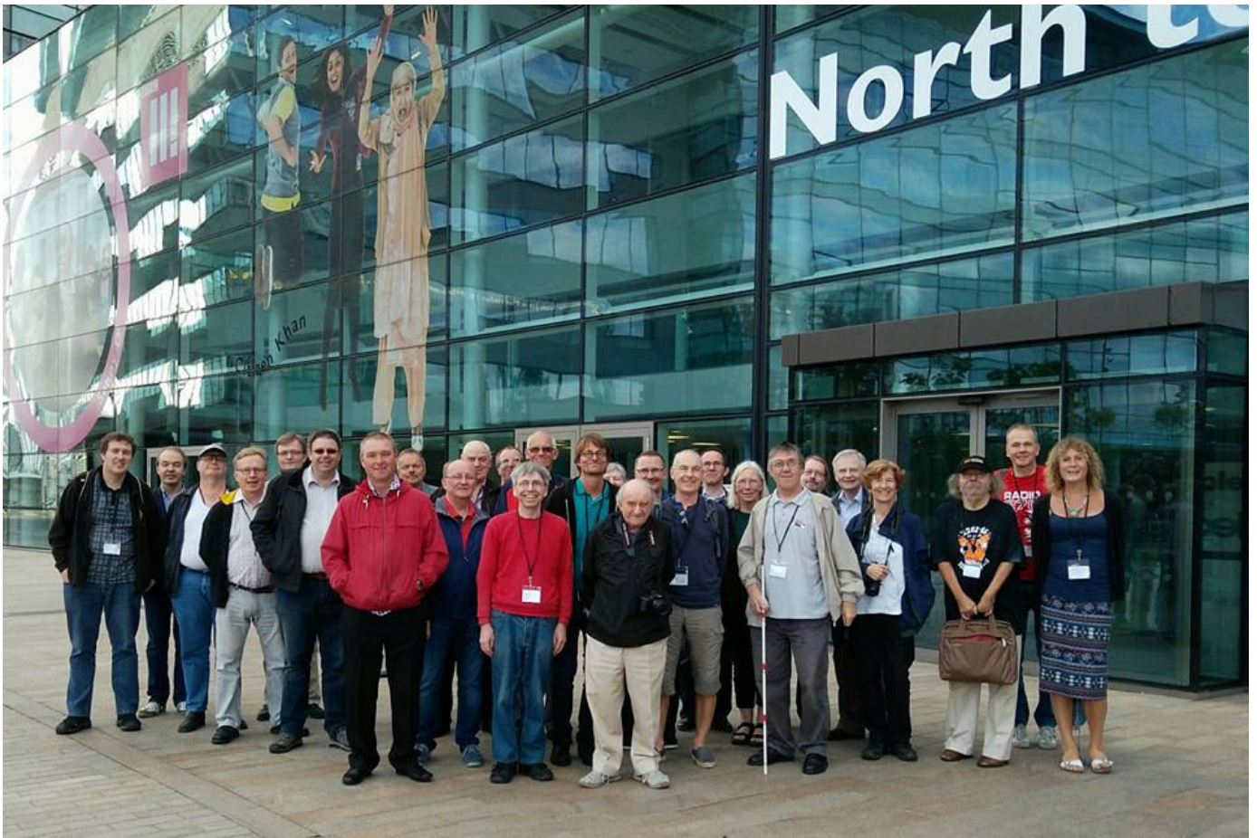
Above: Group photo taken outside the BBC North HQ at Media City UK in Salford during the EDXC conference in Manchester, September 2016.