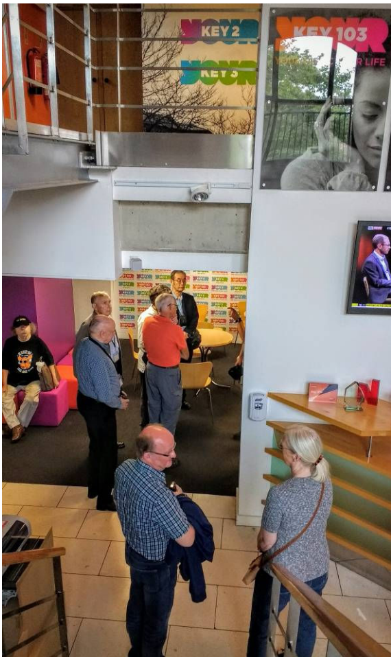
Left: awaiting tour in foyer of studios of radio station Key 103.