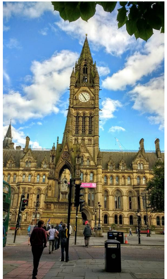
Right: Manchester Town Hall in Albert Square on the EDXC walking tour of the city centre.