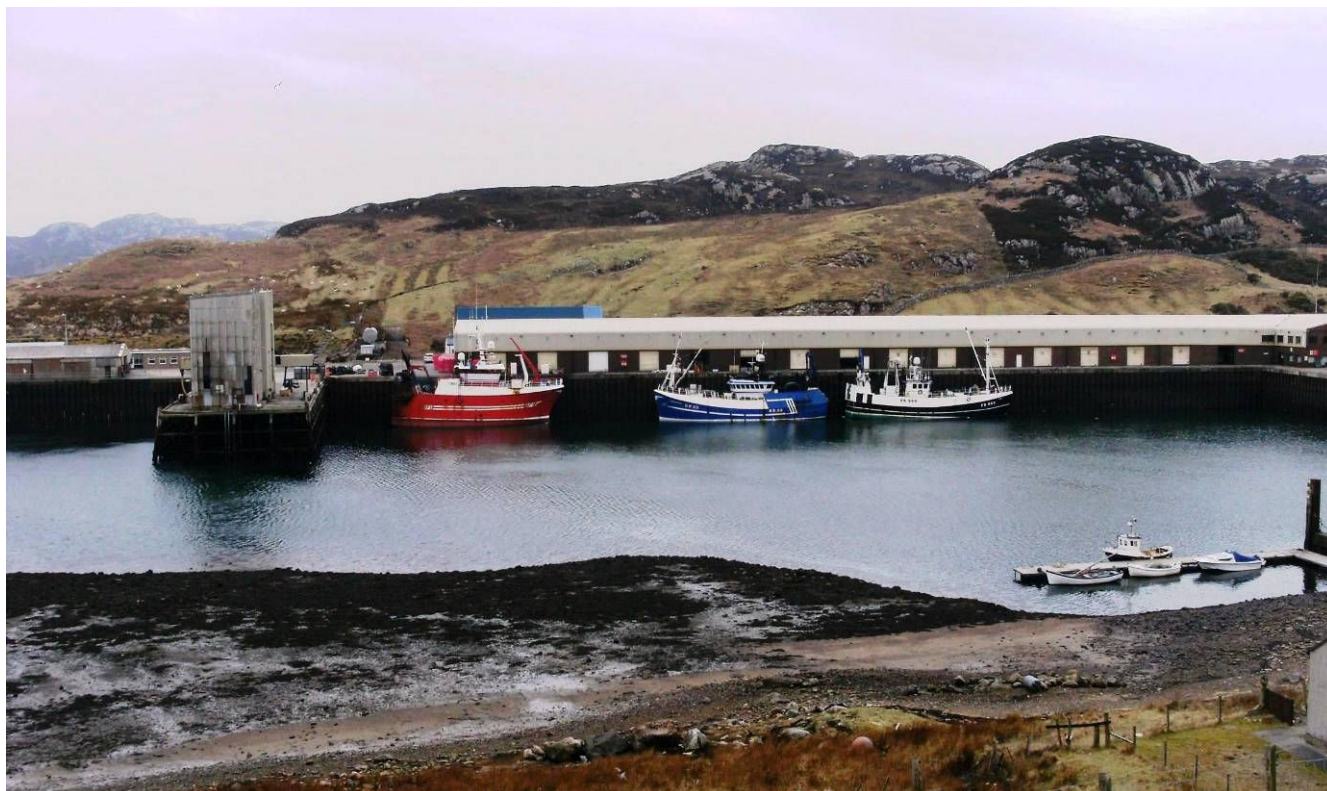
above: Fishing boats moored at nearby Kinlochbervie harbour

1350 1013 11/03 Kingstown R, Hull "the heart of classic hits.....Kingstown Radio" 1386 1647 10/03 Carillon R, 2 sites, Leics oldies // Carillon on 1431. 1386 2300 08/03 R Jcom, Leeds "you're listening to Radio Jcom" 1431 1627 10/03 Carillon R, 2 sites, Leics "Carillon Radio" jingle under Smooth 1575 1005 11/03 R Tyneside, Newcastle-upon-Tyne live DJ chat mentions Radio Tyneside.